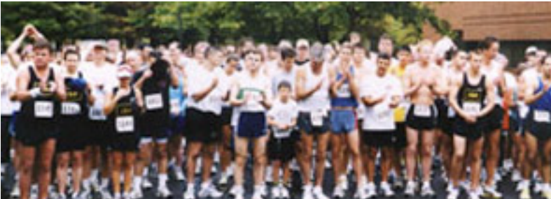
Runners gather in the rain to run for prizes and to raise funds for the Alliance.

The Carnegie Center 5K & Fun Run was held Saturday, October 6, 2002 in West Windsor Twp., NJ to benefit The Parkinson Alliance.